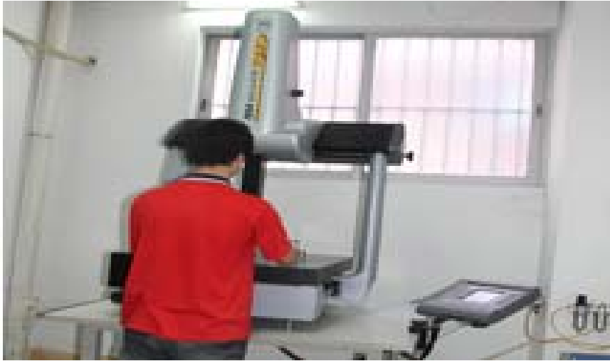
Coordinate Measurement Machine