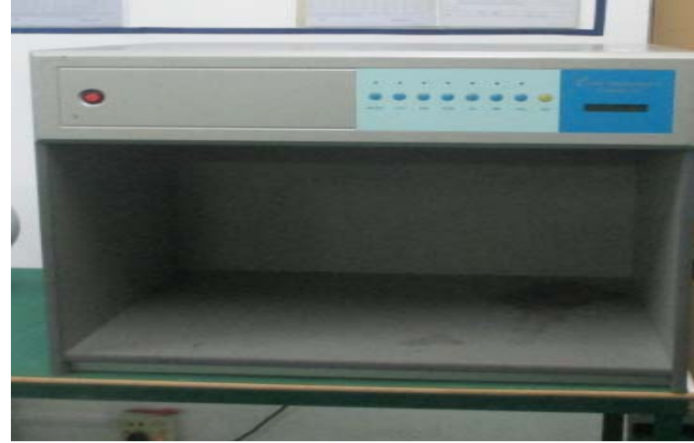
Light source for color box