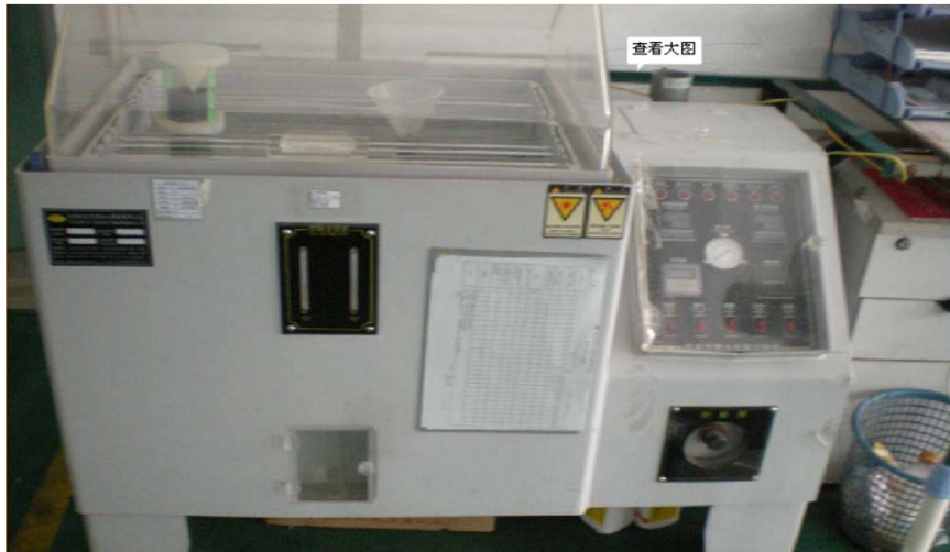
Salt Spray Test Machine